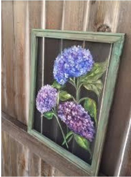
(just an example, not necessarily what we will be painting)